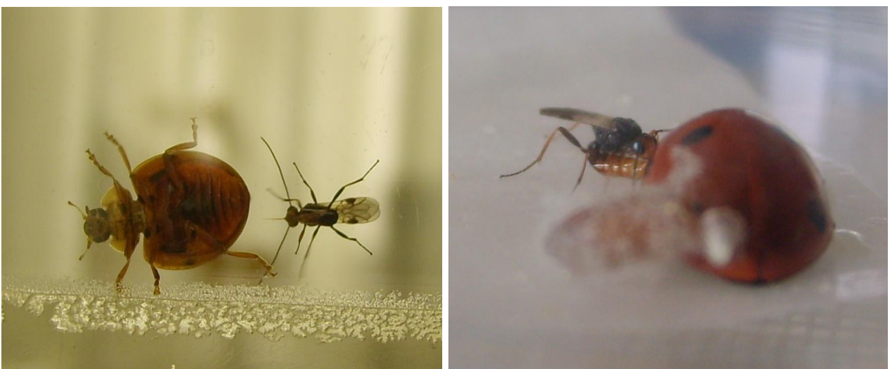
Figure S6. Adult of D. coccinellae trying to lay in H. haxyridis.