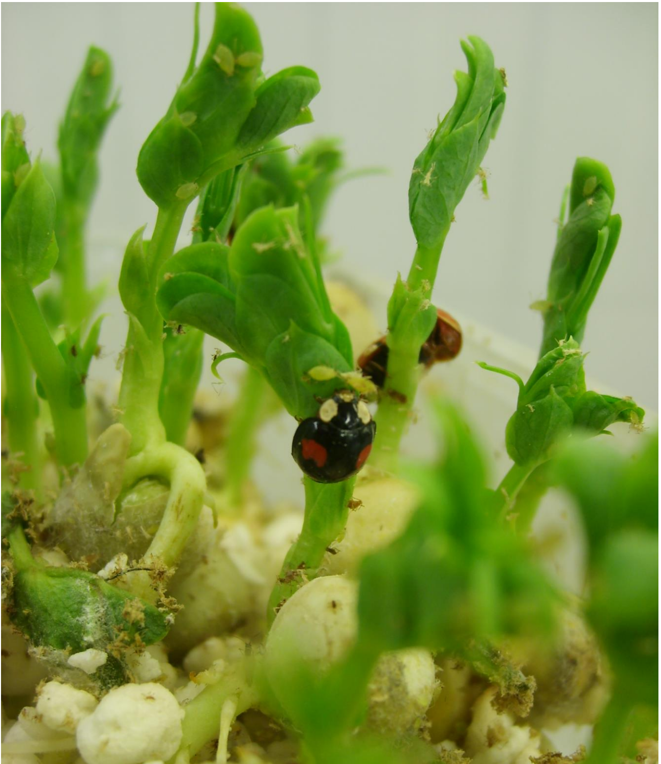
Figure S2. H. axyridis adults fed with aphids ( M. persicae ) reared on P. sativum plants.