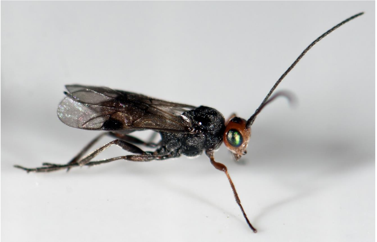
Figure S1. D. coccinellae female [Photo by Serena Magagnoli].