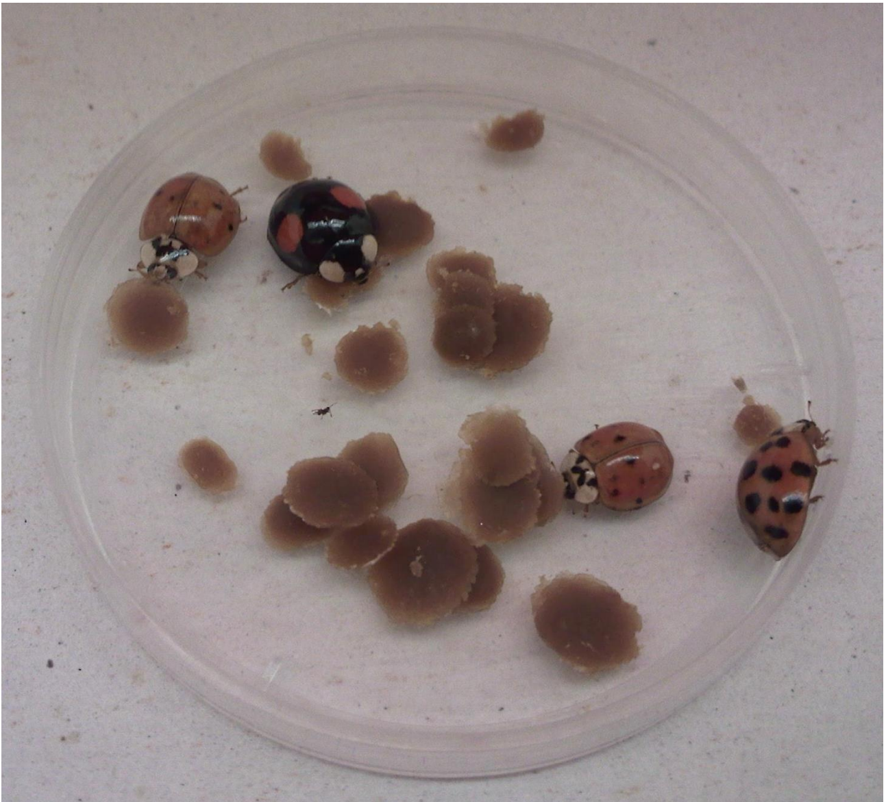
Figure S5. H. axyridis adults fed with drops of artificial diet.