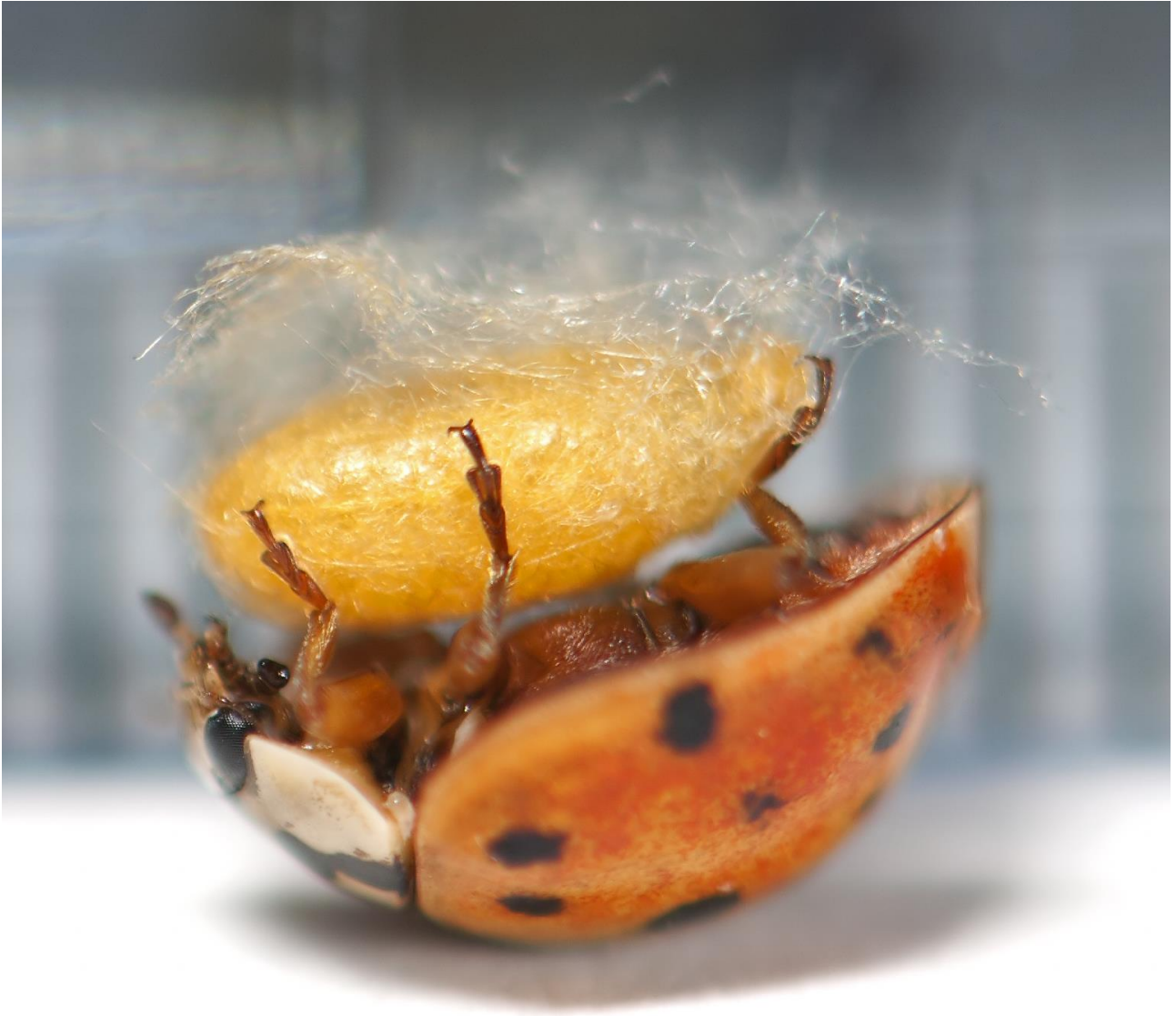
Figure S3. D. coccinellae cocoon on parasitized H. axyridis.