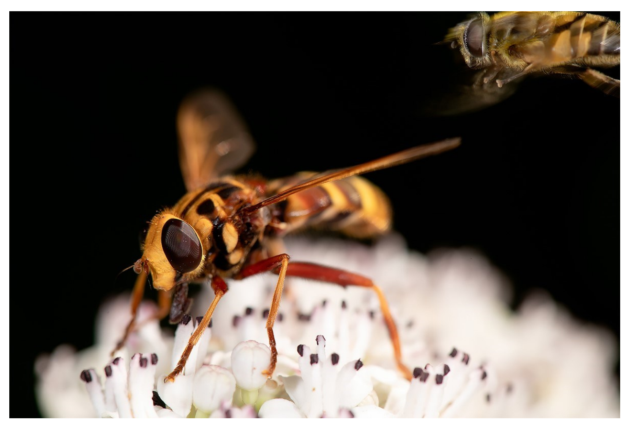
Figure 3. M. crabroniformis and M. florea during the competition for resources.

is mostly associated with natural areas even if occasionally it has been found on hedgerows in rural sites (Burgio et al. , 1997) and near urban gardens within the city (Bologna) (Burgio et al. , 2015). The flight period is documented from July to October (Speight, 2020), but it is worth pointing out that M. crabroniformis has been observed foraging on Hedera sp. by one of the authors (S. Magagnoli) in late autumn (November 21, 2023) in Brisighella (Faenza, Northern Italy) (44.22449N 11.77256E). A similar behaviour was observed in Mile sia cretica Bot et van Steenis, as reported by Bot et al. (2022). The authors highlighted the presence of numerous specimens in late autumn during the blooming period of Hedera helix L.