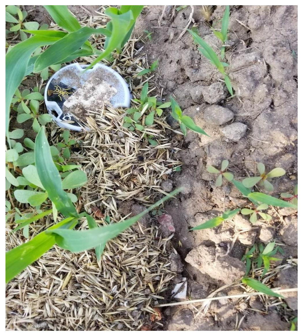
Figure 2. The defensive building around the exploratory ant trap.