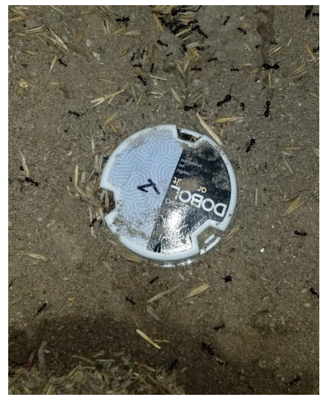
Figure 7. Photograph of site 1 from the 7:00 PM observation period on Day 12.