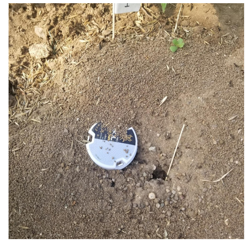
Figure 1. The last day of the control period of the experiment.

Supporting our observations that the ants built a barrier around the bait entrance are the results of turning the trap 90° (days 11-14). Figures 4 through 8 shows a sequence of photographs that when the trap is turned and the bait entrance opened, the ants began to plug the new opening with sticks, dirt, and rocks. A video showing the behavior of plugging an entrance is available at https://youtu.be/WNJUpdPpQyI.