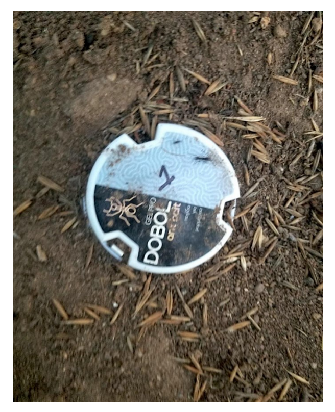
Figure 8. Photograph of site 1 from the 7:00 PM observation period on Day 13.

We would like to note that it was not feasible to provide any quantitative analysis of the photographs. The debris covering the entrances to the trap could not be weighed without disturbing the ants nor was it possible to control for the possibility that other organisms would visit the observation sites. Moreover, the photographs were taken under field conditions making it difficult to provide an accurate quantitative analysis because of shifting light conditions. The best we can offer are the photographs themselves and the video clip.