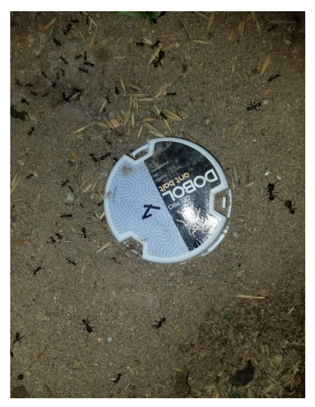
Figure 5. Photograph of site 1 from the 7:00 PM observation period on Day 10. This is the first photograph taken 12 hours after the new entrance was opened. Note the sticks being piled up in front of the entrance.