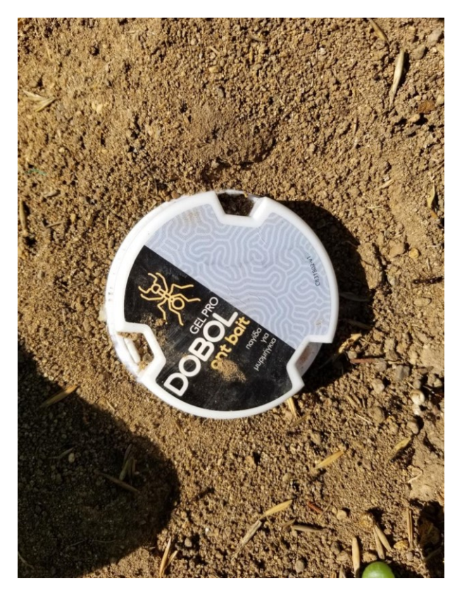
Figure 4. Photograph of site 1 on day 10, the first day the trap was turned 90°. Note that the opening to the right was previously plugged. The entrance to the bottom left will be opened.