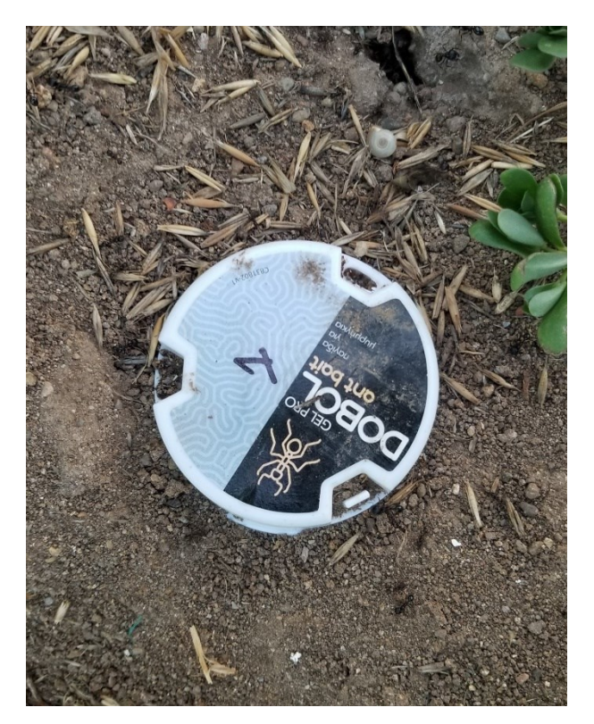
Figure 6. Photograph of site 1 from the 7:00 PM observation period on Day 11.