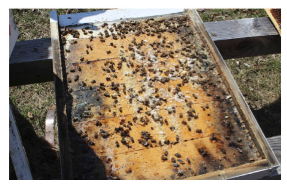
Figure 3. Picture of the bottom board taken from one of the dead neonicotinoid-treated colonies on March 1<sup>st</sup>, 2013. The numbers of dead bees in the six dead CCD colonies ranged from 200-600 dead bees.