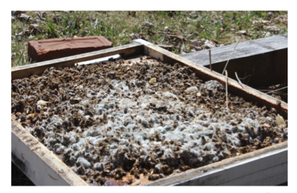
Figure 4. Picture of the bottom board taken from the only dead control colony on March 1<sup>st</sup>, 2013. The volume of dead bees was estimated to be 3.5 l using 1-L graduate cylinder using Atkins (1986) method.

might be due to the fact that the daily average temperature was lower in 63 of 91 days in the winter of 2010/2011 than of 2012/2013. The overall average temperature in the winter months was -3.8 °C (25 °F) in 2010/2011, approximately 2.78 °C (5 °F) lower than in 2012/2013.