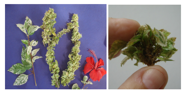
Figure 1. Hibiscus rosa-sinensis with proliferation, short internodes and reduced leaf size.

Eight hibiscus samples exhibiting shoot proliferation, short internodes and reduced leaf size (figure 1) were collected in two locations, in the quarter of Barra da Tijuca, in the city of Rio de Janeiro, Brazil. Six of the samples (1 to 6) were collected in the location known as Península, and two of them (7 and 8) in Barra Shopping Mall. One gram of phloem tissue scraped from twigs of symptomatic plant was submitted to nucleic acid extraction with a chloroform/phenol protocol (Prince et al., 1993). Nucleic acid was employed at the concentration of 20 ng in direct PCR with universal primers P1/P7 (Deng and Hiruki, 1991; Schneider et al., 1995), followed by nested PCR with primers F1/B6 (Davis and Lee, 1993; Padovan et al., 1995), and by a second nested PCR with R16F2/R2 or R16(I)F1/R1 (Lee et al., 1995).